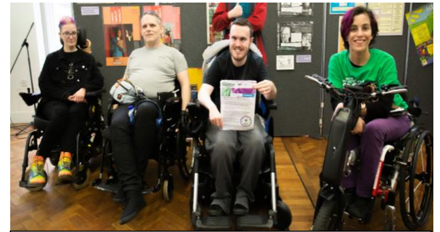
Members of the Project at the Archive Launch

From this, we have also arranged some larger collaboration work with the pro-bono society at Manchester University Law School, in which, we aim to share