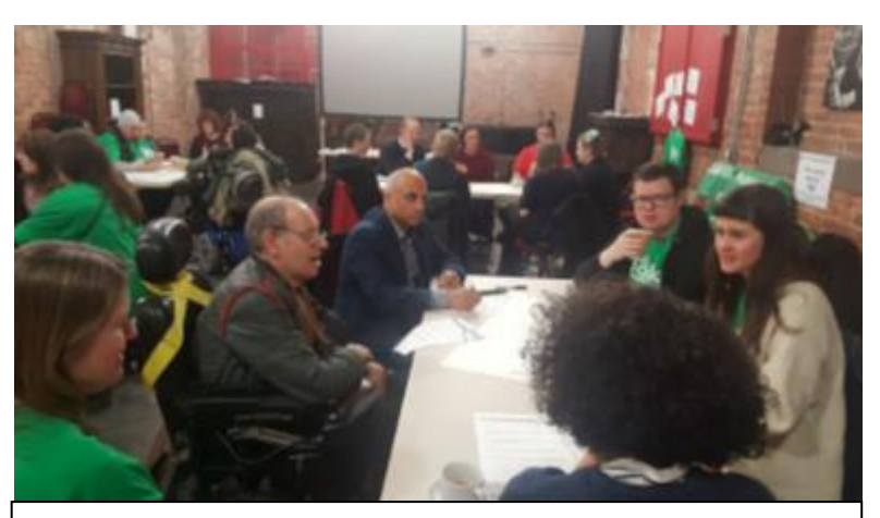
Members at the Defiant Lives event

We have also been running subgroups that feed directly into the Executive and are a great introduction to strategy and decision making processes. These subgroups are